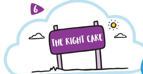
THE RIGHT CARE: CHILDREN'S RIGHTS IN RESIDENTIAL CARE IN WALES