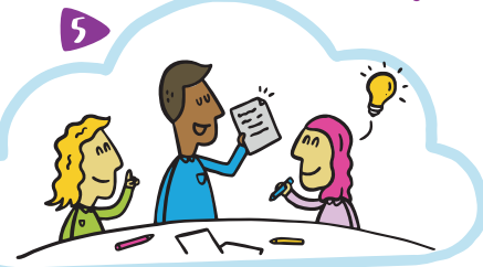
STUDENT AMBASSADOR SCHEME