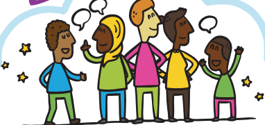
COMMUNITY AMBASSADOR SCHEME