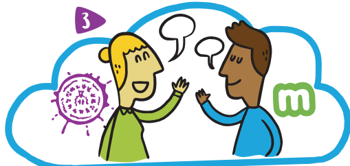
PARTNERSHIP WORKING: MUDIAD MEITHRIN