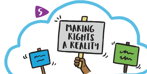
THE RIGHT WAY